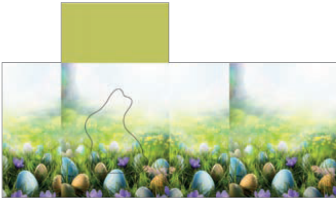
Art-Nr.: 92933 – Ostergarten

2. Place your logo, text and image as desired. Change colour if needed. Finished!