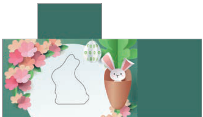
Art-Nr.: 92940 – Blumige Ostern