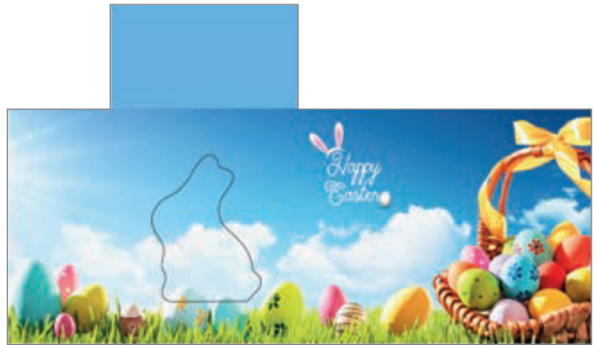
Art-Nr.: 92934 – Sunny Easter