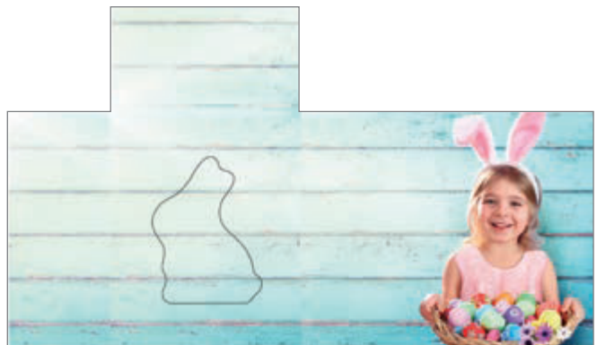
Art-Nr.: 92938 – Sweet Easter