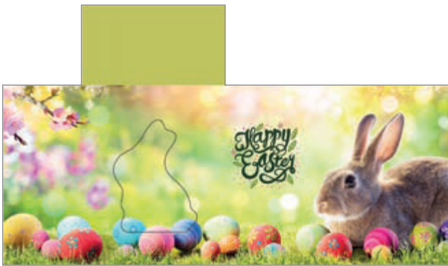
Art-Nr.: 92935 – Frühlingsgefühle